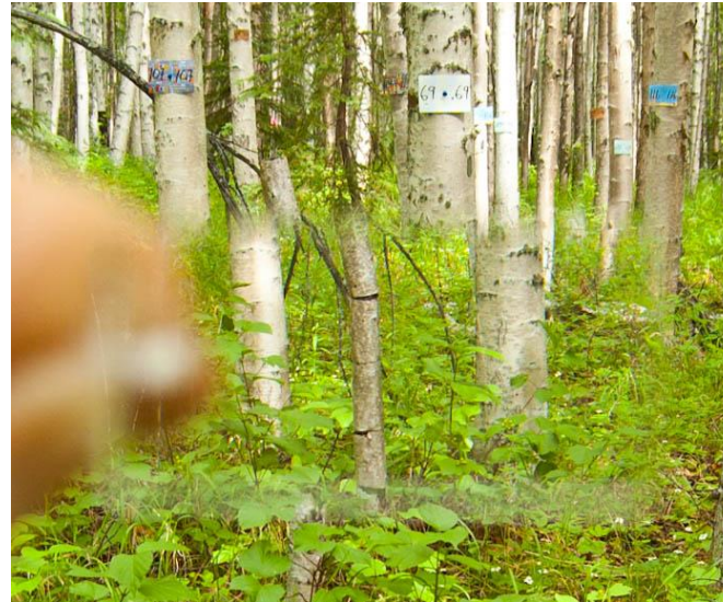
Figure 2. Here the prism displaces the image to the right 1.736° (center of photo). The diameter of tree 69 (center) is ≥ the displacement, and it was therefore included in the sample. The diameter of tree 107 (left) is ≤ the displacement so it was not included.

Stitched gigapans were exported as Photoshop RAW format and opened in Adobe Photoshop CS3. In each image, the locations of the photo points at the other two apices of the triangle were visible, and were used as a test of the approach of substituting a horizontal pixel measurement for a horizontal angle. Interior angles of equilateral triangles are 60°, so the far photo points should be separated in the image by 1/6 (60°/360°) of the pixel width of the entire image.