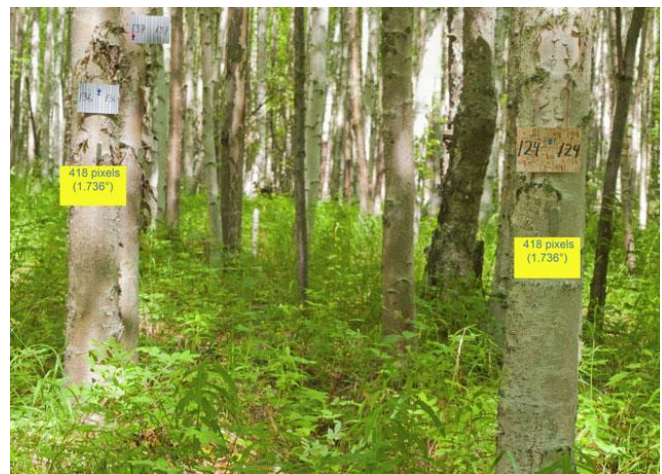
Figure 3. Screen capture from Photoshop with drawn yellow rectangles which are 418 pixels in width. Tree 124 was included in the count, and more distant tree 136 was not. Trees have a numbered card for another image analysis project.