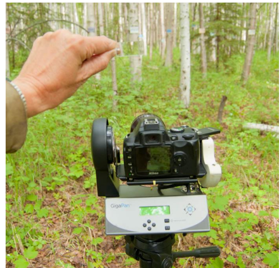
Figure 1. Trees were assessed in the field for inclusion in the Bitterlich sample by viewing the lateral displacement by a calibrated glass prism held over the sample/photo point.

In June, 2010, I established a single study plot in an upland forest (elevation 300 m) between permanent study sites UP2B and UP2C, which are maintained by the BNZ LTER. The study stand has one overstory species, Alaskan birch ( Betula neoalaskana ), and a few understory white spruce ( Picea glauca ). The forest established after a stand-replacing wildfire around 1915, and all birch are similar in age (70-80 years). The understory is dominated by shrubs ( Viburnum edule , Rosa acicularis ) and herbs ( Epilobium angustifolium , Calamagrostis canadensis ), most of which were conveniently shorter than 1 m.